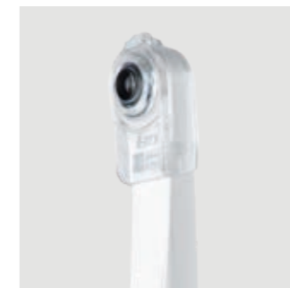
Macro Cap An extremely useful accessory, Macro Cap can magnify up to 100x in ultra-high resolution. Three additional, high purity glass lenses optimise lighting of details located close to the optical unit.