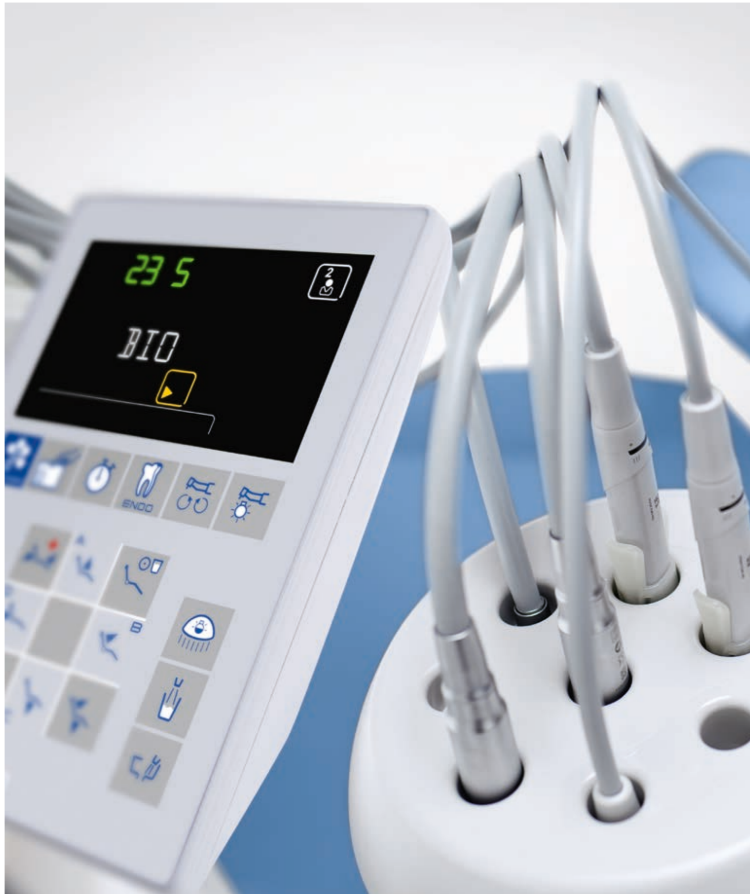
The instruments are inserted in the tray above the cuspidor bowl throughout the BIOSTER cycle.