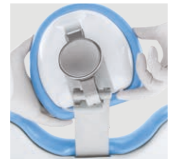
Ataxis headrest The headrest that follows the patient's anatomy. Ultra-simple fingertip release of the pneumatic lock allows orbital movement to achieve perfect positioning, vertical adjustment included.