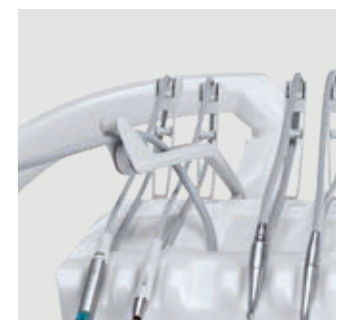
SideFlex instrument levers Removable and equipped with swing joints that also allow lateral movement, the levers alleviate wrist fatigue and are self-balancing. SideFlex instrument levers are available as an optional.