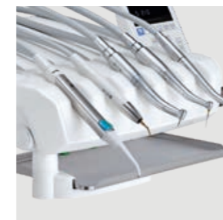
Compact tray The stainless steel tray is conveniently housed under the module. Position-adjustable, it can easily be used by either dentist or assistant. A compact tray of minimum size and bulk is available as an alternative.

All this ensures the dentist can always count on perfectly positioned instruments and, therefore, maximum working comfort.