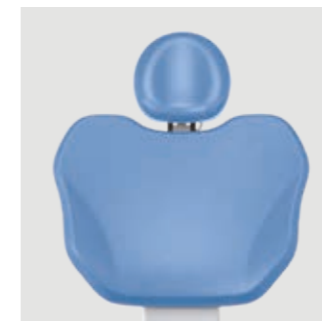
Standard backrest Shaped so that dental staff can move closer to the patient during treatment. Suitable for adults, children and any treatment type.