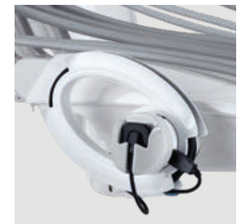
Zen-X X-ray sensor Extractable sensor with USB lead located on the dentist's module, can capture high-resolution images with minimal radiation dosage. Able to be sanitised, the sensor comes in two different sizes and is IP67 certified against water and dust infiltration.