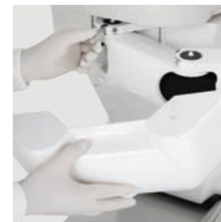
Support release Once the cover has been removed just free the mechanism that allows re-positioning from right to left and vice versa.

The dentist's module rotates on the fixed pin under the seat; the unit body - arm and assistant's module included - can be moved from one side to the other after releasing the support.