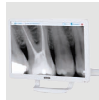
22" LED Monitor 93/42/EEC certified, the monitor is also available in the multitouch version; the screen can be positioned as desired.

Coupled with a latest-generation HD video camera, the Full HD 16: 9 tilt-adjustable 1920 x 1080 pixel flat screen medical monitor can be lead-connected to a PC. The LED light sources ensure high levels of contrast and brightness, while the IPS panel, which significantly broadens the screen viewing range, allows images to be comfortably viewed from any angle.