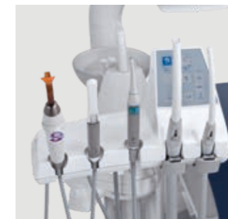
Assistant's module The module mounted on the double-articulated arm is height-adjustable and comes with three holders as standard. An optional 5-holder version is also available: this can be used to hold other instruments such as a video camera or T-LED light. The keypad incorporates controls that move the patient chair, switch on the operating light and operate the water-to-cup and cuspidor bowl rinse functions.