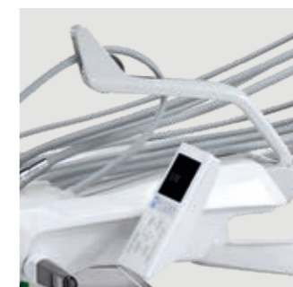
Instrument excursion Generous instrument tubing excursion ensures improved comfort in all operating positions around the patient.