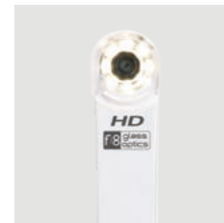
C-U2 HD camera The video camera aids dentist-patient communication and, thanks to the slender handpiece design, it can reach distal zones with ease. Excellent depth of field eliminates any need for manual focusing. Speeds up diagnostics and generates material for documenting the treatment and completing clinical reports.