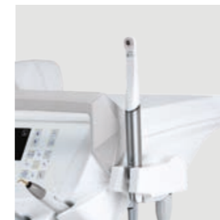
Sixth instrument The international dentist's module can be completed with an optional sixth instrument: camera or T-LED light.