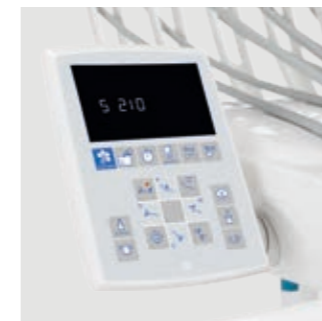
Re-positionable control panel Continental model users can move the control panel to the opposite side of the dentist's module, thus optimising ergonomics and making the dental unit 100% ambidextrous. Just rotate the on-panel connector 180° and reconnect it to the tablet. The task takes less than a minute.