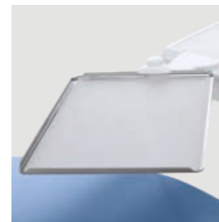
Tray holder Large transthoracic tray holder (optional) mounted on the International module.

hygiene systems and other integrated devices. Where the i-XS4 micromotor is present the instrument control panel also provides a full complement of endodontic functions (including control of the apex locator, with data display during canal treatment).