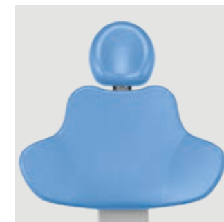
Nordic backrest Ensures lasting comfort during protracted treatment sessions and shaped to aid dentists who work in 'indirect vision' mode.