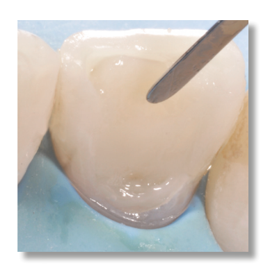
Apply elastically LM-Arte Applica

A very thin and flexible spatula is designed for transporting and esthetic modeling the composite. The flexible working end sculpts gently and precisely composite layers imitating the natural shapes of the tooth. The thin tip of the Applica enables the modeling in narrow spaces or against the matrix band.